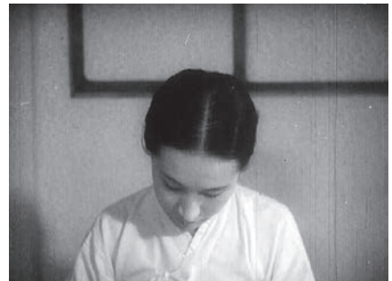
Fig. 11. Straits of Chosun: Cut to camera movement back of Kinshuku