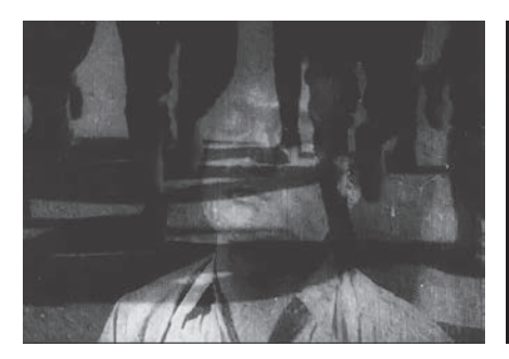
Fig. 5. Volunteer : The end of his reverie: marching feet and closed eyes.