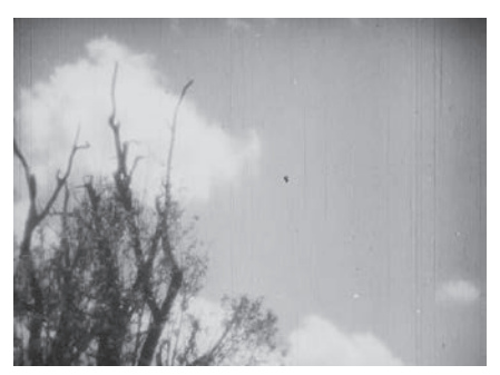
Fig. 10. Straits of Chosun : What he is supposedly looking at