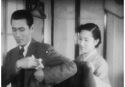
Fig. 13. Straits of Chosun : A cut brings us into her memory