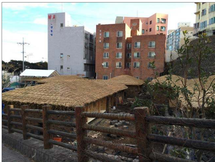
FIGURE 3. Kim Mandök Kaekchut'ö reconstruction. Photo taken by the author, 2015.

project's exaggerated T'amna-ness has aroused bemusement, derision, and ambivalence.