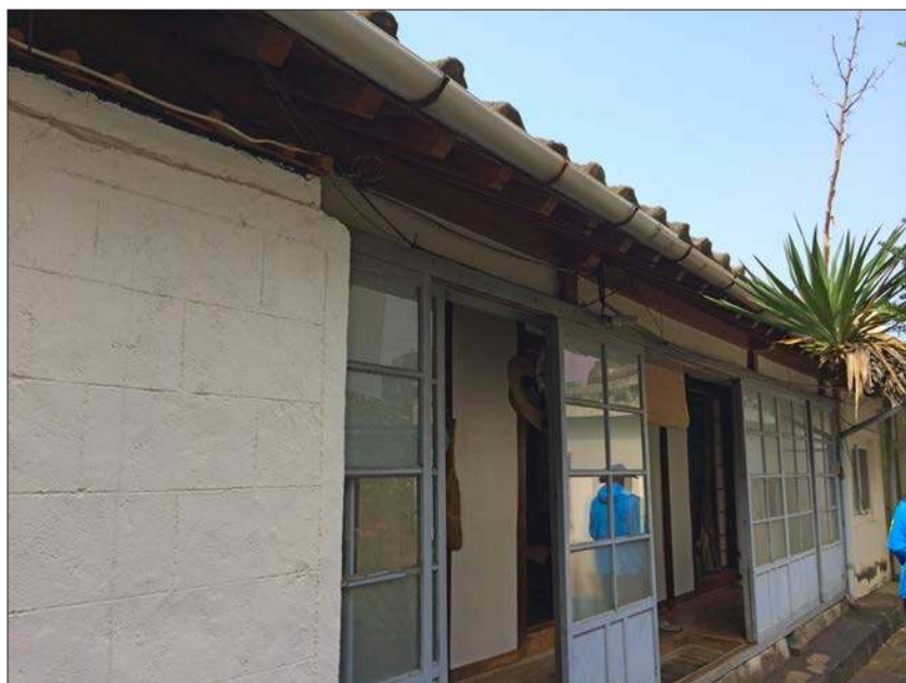
FIGURE 7. The Ko family house near Sanjich'ön stream.

ries is not only to challenge grand narratives of linear progress but also to reveal the cracks in such edifices.