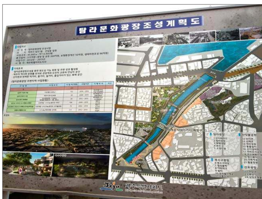
FIGURE 1. The T'amna Culture Plaza project billboard.

tion or redevelopment. A contradiction has emerged, with supposedly green tourism's popularity fast becoming the primary source of environmental degradation and cultural erasure. Local residents are beginning to reassess Cheju City's old town area, once a neglected slum and quasi red-light district, as representative of Cheju's conflicted and multilayered experiences. Yet heritage practice, too, is contested. A more divisive issue in local debate is whether new symbols of a lost collective T'amna 2 past should be rehabilitated or reinvented even at the expense of sites of memory. Debate over the future of Cheju City's lost past is no longer confined to the island's disappearing rural traditions and has meandered into the city's winding streets between the bricks and concrete. Retrospective looks at Cheju City's kyōngkwan (scenery) in its post-1960s development consider its monotonous appearance as failure and as the loss of cultural autonomy made physical (Kim TI 2007).