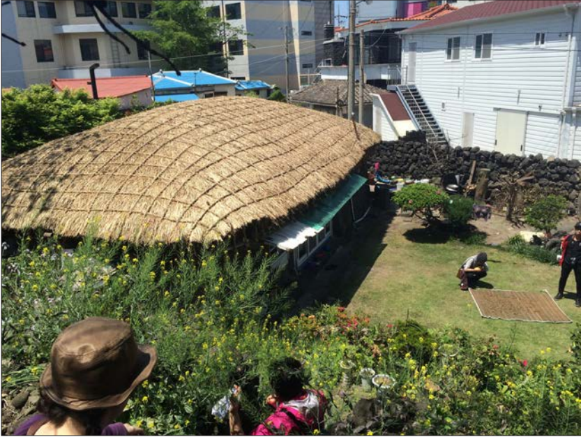
FIGURE 4. The Pak family's traditional thatched house.

reconstructions, which occasionally puts them at odds with other cultural and historical associations.