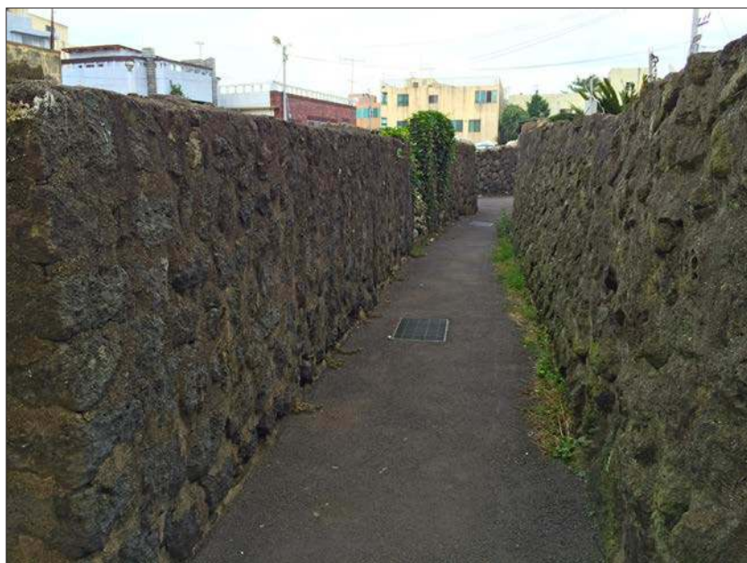
FIGURE 6. Old city neighborhood near Kwandŏkjŏng.

of a cliff overlooking the entire wŏndosim area. Ko felt that this was ultimately at the expense of the Chungang Kamni Kyohoe, a Methodist church made of Cheju volcanic rock first built in 1928 at the same site. This debate nonetheless demonstrates how aspects of heritage discourse could be used for competing positions. Ko's and JICEA's position argued that modern heritage sites possess aesthetically unique architecture and have histories that can be directly verified in both memory and actual record, whereas buildings such as Kongsinjŏng are based on estimation, if not speculation. Pak Kyŏnghun's and the pro-Kongsinjŏng position argued that the general agreement of extant historical records indicated that estimations were likely accurate and that the building was long a crucial part of early Cheju City because it had a view of the entire city. Age took precedence, and the Kongsinjŏng site earned official designation. The church was demolished. 26 Disagreements regarding Cheju City's heritage assets and what constitutes a Cheju-specific city continue.