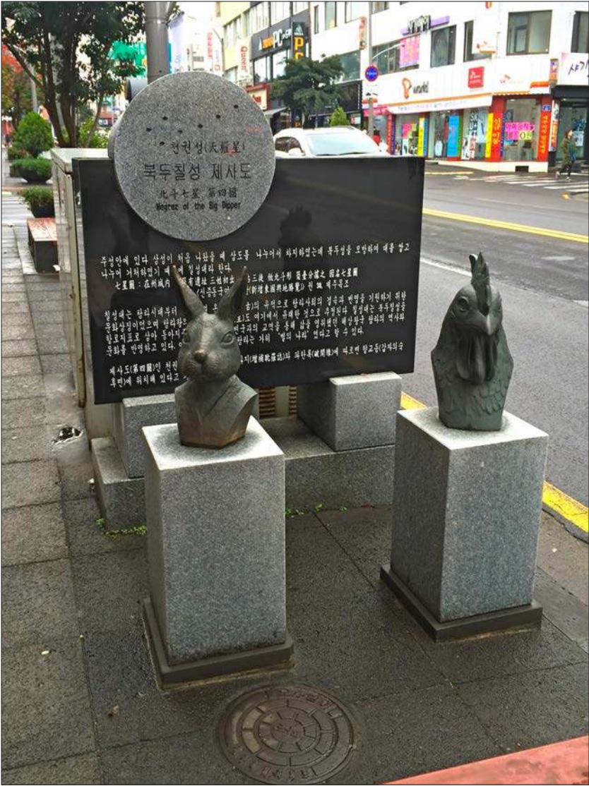
FIGURE 2. One of seven stylized commemorative stone signs at sites based on a 1979 interpretation of the location of Ch'ilsöngdae.