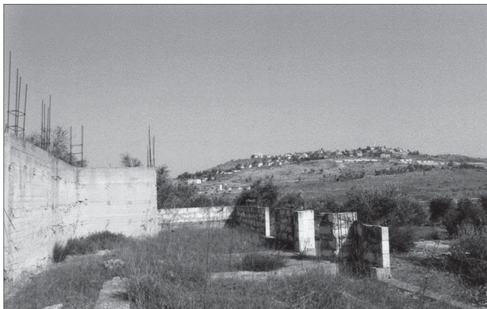
The destroyed foundation of what was to be my family home in Turmosayya, Palestine, with Shiloh settlement in the background (35 mm, B&W photograph by the author).