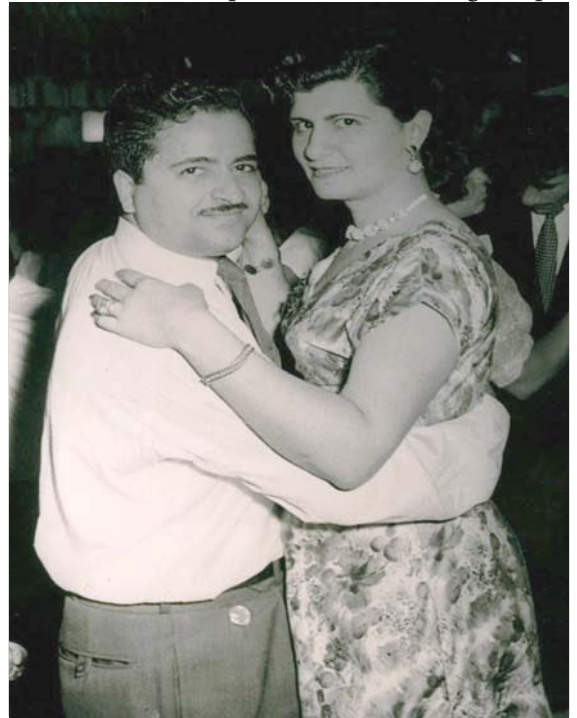
Mom and Dad at their first New Year's celebration, Haifa, 1957.

Both of my parents are returnees who insisted on preserving home, each in their own way. My father, who became a lawyer, believed that learning the techniques and laws of the new state authorities would prevent the displacement and uprooting of returnees like him and my mother. This is precisely how he met my mother. His unprecedented love for my