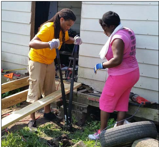
Project volunteers working on the handicap ramp, June 2014.