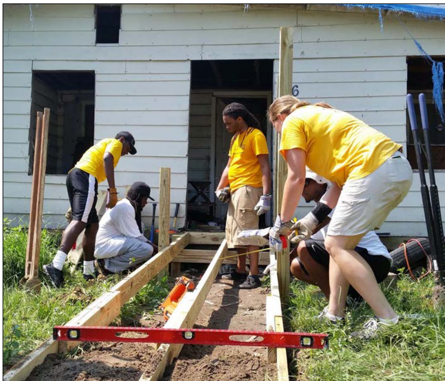
Project volunteers working on the handicap ramp, June 2014.