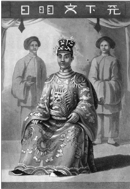
FIGURE 5. Emperor Minh Mệnh.

The Nguyễn court's policies of tax reduction and waivers in the first three decades of the nineteenth century helped to partially restore production at most old mines alongside the exploration and operation of some new mines. From 1808 to 1810, the number of mines reached its peak of sixty to sixty-five regularly exploited mines, even though this number could not be sustained for long. In the 1820s, the number of mines in production ranged between fifty and sixty a year. However, the early 1830s marked a significant change in the court's mining policies. In 1831 Emperor Minh Mệnh decreed: