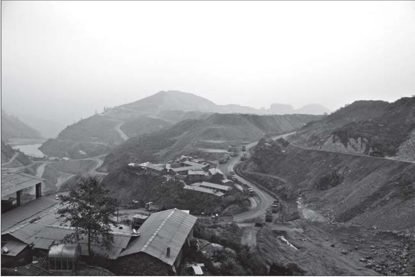
FIGURE 4. The modern Tụ Long mine at Ma-guan district, Yunnan province, China.

Tuyên Quang, Cao Bằng, Lạng Sơn, Hưng Hóa, and Sơn Tây. These mines produced gold (31), silver (13), copper (7), iron (25), zinc (5), lead (4), tin (1), pig iron (4), saltpeter (15), sulfur (2), and cinnabar (1) (Phan 1999, 698). Although the productivity of the mines was average to low, the quality of their output was high. Moreover, since many had not been in production for long, according to contemporary observers, “the greatest profits came from mines in Tuyên Quang, Hưng Hoá, Thái Nguyên and Lạng Sơn. Mines in northern Vietnam were relatively productive, in particular mines of gold, silver, copper and tin, that were extremely valuable” (LT 1992, 263). In the late eighteenth century, the Tụ Long (or Dulong) mine along the border with China (in what would become Yunnan province once the Treaty of Border Delimitation was signed between the Qing Empire and France in 1887) had an annual production of 220–280 tons and was considered one of the most productive copper mines in Asia (Woodside 1997, 259–260) (figures 3 and 4).