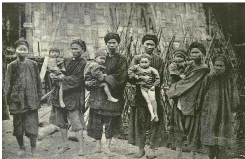
FIGURE 1. The Thổ (Tày) of Cao Bằng province.