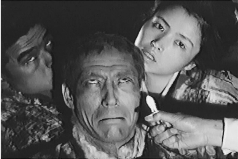
Still 1. Goze.

had met a couple of years prior, to serve as wet nurse and lover. 31 Not only does Oine fill the role of wife and mother, but she is a dead ringer for Sono. Both roles are played by the actress Ōtani Naoko, and the resemblance is used to effect many times. Aochi's wife, Shūko (Ōkusu Michiyo), with her bobbed hair and stylish Western clothing, is a liberated woman of the era. She has an affair with Nakasago and hides his copy of the Sarasate record the film is named for. Shūko's sister, Taeko, who is dying in a sanatorium, has a special affection for her brother-in-law, Aochi, and a scene of her topless in the hospital bed implies that it may have been mutual.