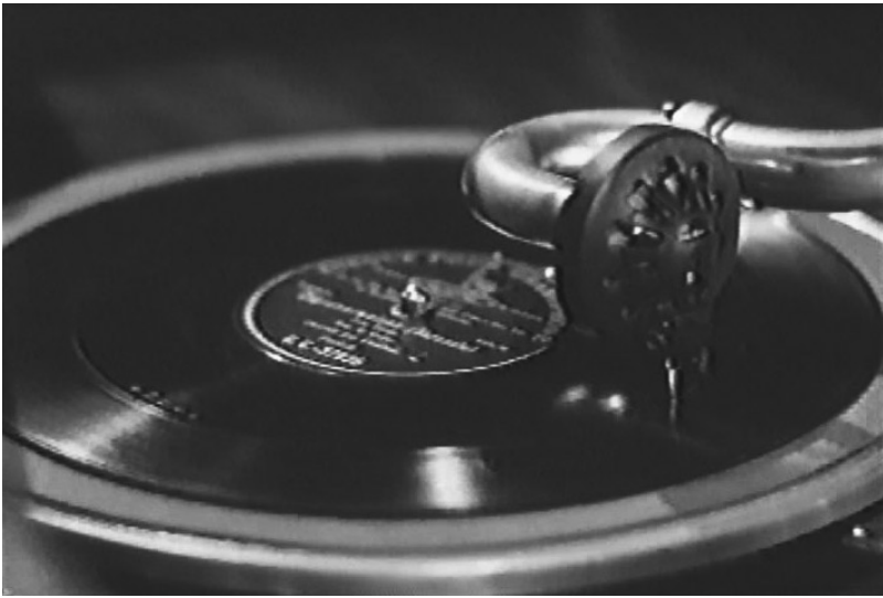
Still 4. Still gramophone in Nakasago's study.

Shūko screams and moves to the window. The camera cuts back to a shot of the still record, visually couching this new voice within the larger framework of the indecipherable mumblings on “Zigeunerweisen.” The last line of the above dialogue is marked in the screenplay as “voice” ( koe ), and Aochi is certain it was not his. Nakasago is convinced that either it came from Aochi’s mouth or, worse, Aochi is starting to hear things. At best, it is a sign of a nervous breakdown ( shinkei suiaku ), and at worst, insanity. Nakasago seems even more frightened by the story than Aochi. He mutters “ki o tsukenakucha” (better watch out) almost as a warning to himself. Nakasago is amply spooked by this story, but there is yet another layer of doubling that adds depth to his reaction. This last type of doubling moves beyond the confines of the film to create a layering effect with characters in literary texts and with historical literary figures.