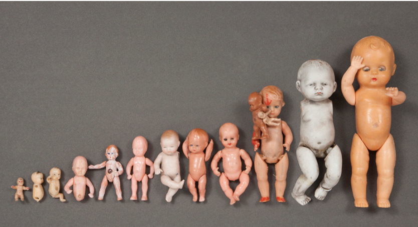
Figure 2. Dolls used by Davenport Hooker in positioning the camera, now housed at the National Museum of Health and Medicine.

give Hooker an estimate, though often an inaccurate one, of the stage of the pregnancy. To stage the camera and spotlights in advance, Hooker would select one of a set of small plastic baby dolls that approximated the expected size of the fetus (see Figure 2). Once in the room, one to two and a half minutes was the average time between the separation of the fetus from its placenta and the first filmed stimulation. 40 In very few early instances, Hooker's team would attempt to keep a nonviable fetus alive by providing the attached placenta with oxygen, but this did not discernibly extend the duration of the experiment, and the practice was soon discontinued. 41 Motion picture itself allowed for greater speed during the experiment and better opportunity for detailed observations: the Pittsburgh team could make frame-by-frame notes of movements that were otherwise indiscernible. Each case could be reviewed and transcribed repeatedly, by different observers, at different times.