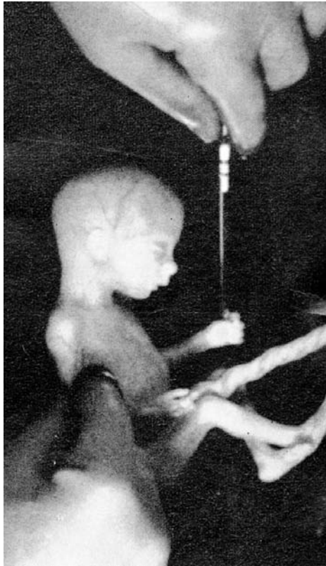
Figure 1. Film frame of a five-month-old fetus, as pictured in Look magazine in 1962.

Throughout this experimental procedure, time was critical, as nearly all of the fetuses in Hooker's studies were in the process of dying. 38 Removed or delivered prematurely, they gradually asphyxiated without either a supply of oxygen through the placenta or lungs mature enough to be capable of respiration. Younger fetuses were responsive for approximately eight to twelve minutes, older fetuses for around twenty minutes. 39 Under these circumstances, the Pittsburgh team needed to begin experiments as close to the surgery as possible and mitigate predictable losses in time. Prior to the hysterotomy, the clinician performing the surgery would