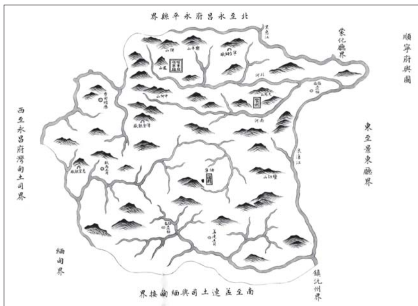
FIGURE 3. Map of Shunning Prefecture, 1818.

the tea-trade building into an official store and created a tea-coupon system similar to that used in the salt trade. Businesspeople had to first apply for tea coupons from prefecture officials, then take these coupons to the mountainous areas east of the Mekong River in Puer Prefecture to buy tea from the official tea store, and finally move the tea by caravan to other parts of China (Kun [1886] 2003).