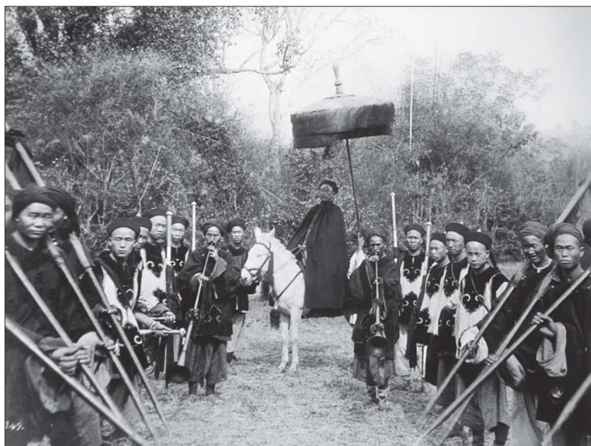
FIGURE 6. Chinese official with bodyguard during the boundary commission, 1899.

According to Xue's strategy, if the Qing government had to draw a clear border with Burma, the first step was to extend the Qing government's territory. The Five Buddha Districts system had to be destroyed first to allow a county to be built in this area. These steps were necessary preparation for the later border negotiations with British powers in Burma.