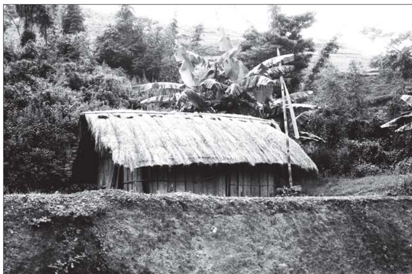
FIGURE 5. A village temple in Muga Valley, 1995.

sons, Zhang Chaowen (张朝文) and Zhang Shibao (张石保), inherited the leadership (Cen [1897] 1989, 901). It seems that the centralized leadership of the Nanzha temple and its branch at Mannuo Village in Upper Convert was under the control of the Zhang family for at least four generations, from Monk Tong Jin, through his male descendants, to Zhang Chaowen, who escaped to Burma in the early 1900s. Under the Five Buddha Districts system, all villagers had to provide their corvée and pay taxes. The Upper Convert village heads, or kha 54 ?ie 33 , organized strong male villagers into warrior bands of three men each: one to carry the crossbow, one to carry the spear, and the last to hold the coutel, a short knife or dagger. These village warriors were known as the ma 31 pa 31 or ma 31 ya 53 , and their commanders were called the ma 31 pa 31 lu 35 —meaning the heads of the warriors ( bing tou 兵头). Weapons included arrows and firearms made in some Lahu villages, which could shoot to a distance of over 200 meters (Bian Weihui 1995, 41). The many well-known folk stories at my field site in Muga Valley about a wise man who used to be a warrior suggest that the village-based, militarized power deeply shaped the everyday lives of people under the Five Buddha Districts system.