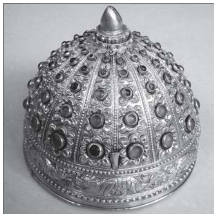
FIGURE 1. The silver hat of E Sha Buddha.

This article discusses how the Five Buddha Districts was at first a militarization system under the leadership of Big Vehicle Teaching monks, as well as how an elite family developed its hereditary religious power as E Sha Buddha, a kind of Buddha king, among the Lahu communities for at least four generations. This leader claimed a godlike power among the Lahu, but also performed another role for many years as the native chieftain representing the Lahu in front of Qing officials (figure 1). 1 The Qing officials' strategy was to allow the E Sha Buddha to control the mountain communities if neither the Qing officials nor the Dai chieftain could effectively do so. The Qing officials regarded the culture of the Lahu people as very different from that of the Han Chinese, but although they practiced a different economic system and spoke a different language, the officials were willing to listen to the words of these monks. Thus, monks like those from the Zhang family established their own administrative systems, dividing the whole West Mekong mountain area into several administrative districts like a centralized kingdom. These monks-cum-political leaders still maintained their subordinate roles as low-level "local chieftains" ( tumu 土目), however. They interacted with the Qing state for many years, until the Qing government finally destroyed the system in response to social changes taking place in Burma with the coming of British colonial power after 1885.