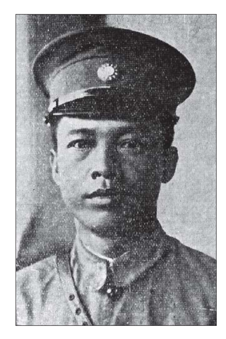
FIGURE 2. Chen Jitang in the late 1920s or early 1930s (no later than 1931). Source: Who's Who in China (1931, 46).