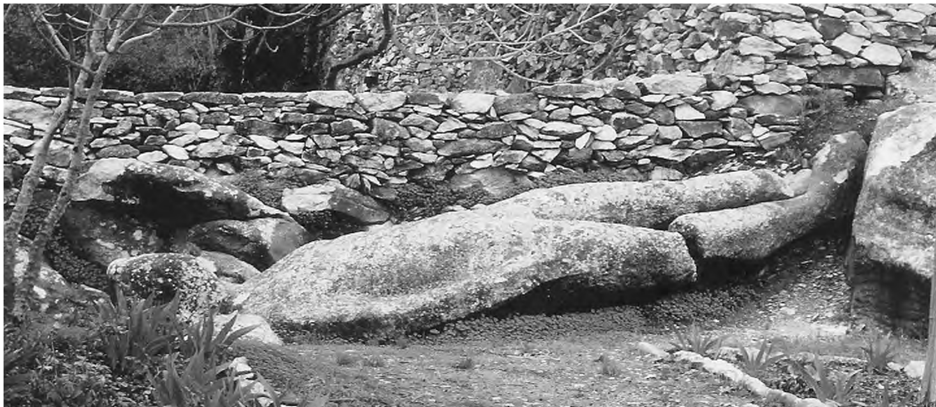
An ancient marble kouros statue sculpted in situ and left in a marble quarry on Naxos, a reminder to present inhabitants of the eventful past buried beneath the surface.

expropriated their revenue, and upon independence, the state wasted no time in nationalizing the mines. At the time of the first dreams then, the villagers were in a downward spiral of dispossession. The dreams of buried icons expressed the proprietorship of their land in spiritual terms that transcended the jurisdiction of the state.