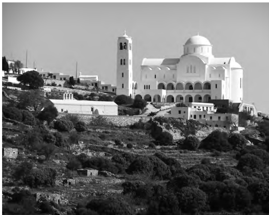
The prophesied church at Argokoili near the village of Kóronos nearing completion in 2011, with the non-whitewashed 1851 church in the left foreground.

nine-year-old Crow Indian Plenty Coups. In the mid-1850s, as the Crow came under increasing pressure from the Sioux and settler expansion, he experienced a dream in which buffalo poured out of a hole in the