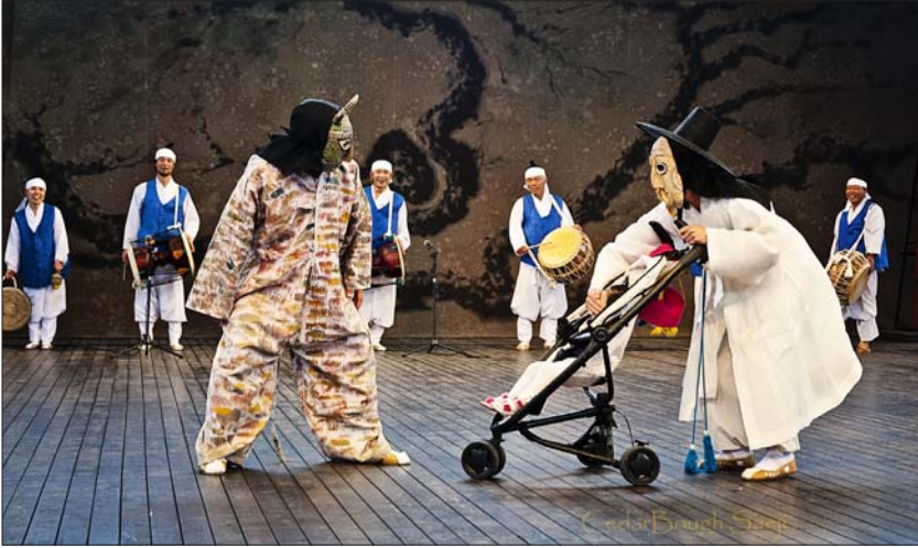
FIGURE 5 Goseong Ogwangdae 's Bibi wants to eat the upper-class yangban , but the yangban pretends to be a mother walking a toddler (temporarily kidnapped from the audience). Afraid that Bibi will frighten the child, the yangban covers her eyes. This type of audience interaction and sudden ad-libs are more common with some groups (and players) than with others.