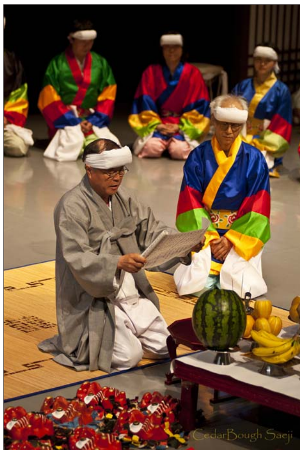
FIGURE 8 At the start of full-length mask dance drama performances a gosa ceremony is performed, led by senior members of the preservation association for the art. The masks are laid out around and behind an altar with candles, fruit, dried fish, glutinous rice cake, a boiled pig's head, and makgeolli (a milky fermented brew).

meant to scare away evil spirits, both from the performance and from the village where it was being held. In the sandae noli and talchum plays purification is accomplished through the dance of novice monks, who bow in each direction. In yayu and ogwangdae plays there is a scene with five characters who are simultaneously five generals representing the five directions and