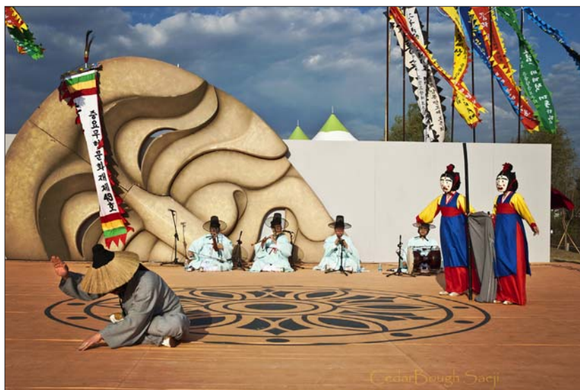
FIGURE 7 Nojang, the old monk, has seduced the two Somu, but after washing his face and otherwise straightening himself up, he stops to play a game of cards. Note the sambyeon yugak -style musicians behind the performers, unlike the drumming troupes visible in some other photos.

this humor is earthy, and it generally needs no dialogue: characters are pushed, they fall, they pull at each other or fall over each other. Sometimes words are part of the joke, such as a son finding that the one part of his mother's corpse that is still warm is the place that "father likes the most."