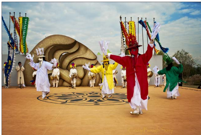
FIGURE 3 The five yangban (upper-class literati) represent the five directions. Yellow (the center) is their leader; Black (north) is out of the frame of the photo.

only set carved entirely from wood. The masks from all other dramas were customarily burned at the end of the show to dispel any associated spirits.