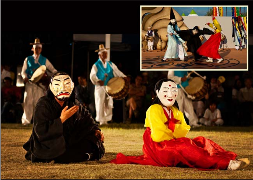
FIGURE 10 The two shishiddakddaki (bandits) in Gangneung Gwanno Gamyeonggeuk are jealous of Somae Gakshi's relationship with Yangban. They perform a scary dagger dance and try to tear Somae Gakshi away. The young lady, however, is uninterested.

transcribed dialogue ignores how many words were actually audible to the audience, artificially increasing the importance of the individual lines.