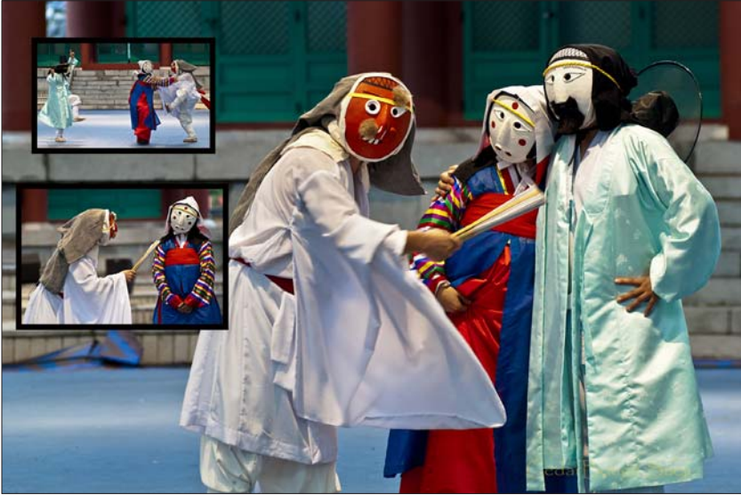
FIGURE 4 This collage from Yangju Byeolsandae shows how the police inspector spies an old yangban (upper-class literati), Saennim, with a pretty young concubine, Somu. He courts her (angering the old man), but at last the old yangban with his harelip must give up and let the young people be together.

permitting the straps to be tightly cinched at the base of the neck without too much discomfort. With the exception of a few starring roles, the performers constantly rotate through the different parts; hence for those with unusually large or small faces the eye holes are sometimes poorly placed.