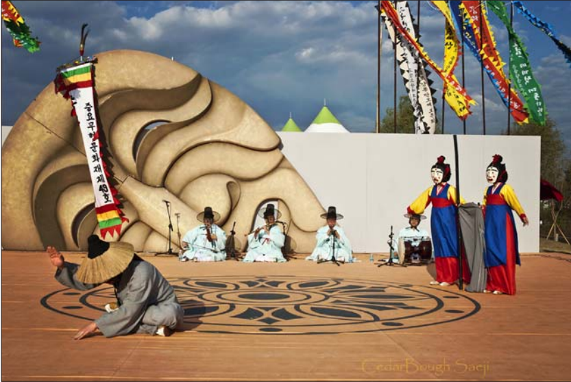
FIGURE 7 Nojang, the old monk, has seduced the two Somu, but after washing his face and otherwise straightening himself up, he stops to play a game of cards. Note the sambyeon yukgak -style musicians behind the performers, unlike the drumming troupes visible in some other photos.

this humor is earthy, and it generally needs no dialogue: characters are pushed, they fall, they pull at each other or fall over each other. Sometimes words are part of the joke, such as a son finding that the one part of his mother's corpse that is still warm is the place that "father likes the most."