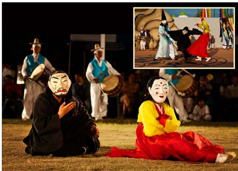
FIGURE 10 The two shishiddakddaki (bandits) in Gangneung Gwanno Gamyeonggeuk are jealous of Somae Gakshi's relationship with Yangban. They perform a scary dagger dance and try to tear Somae Gakshi away. The young lady, however, is uninterested.

transcribed dialogue ignores how many words were actually audible to the audience, artificially increasing the importance of the individual lines.