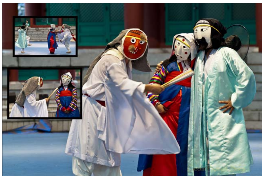
FIGURE 4 This collage from Yangju Byeolsandae shows how the police inspector spies an old yangban (upper-class literati), Saennim, with a pretty young concubine, Somu. He courts her (angering the old man), but at last the old yangban with his harelip must give up and let the young people be together.

permitting the straps to be tightly cinched at the base of the neck without too much discomfort. With the exception of a few starring roles, the performers constantly rotate through the different parts; hence for those with unusually large or small faces the eye holes are sometimes poorly placed.