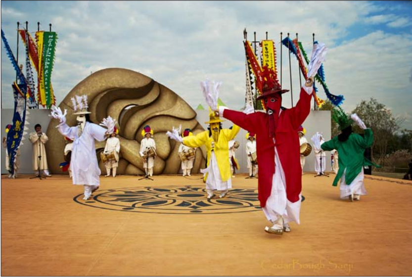
FIGURE 3 The five yangban (upper-class literati) represent the five directions. Yellow (the center) is their leader; Black (north) is out of the frame of the photo.

only set carved entirely from wood. The masks from all other dramas were customarily burned at the end of the show to dispel any associated spirits.