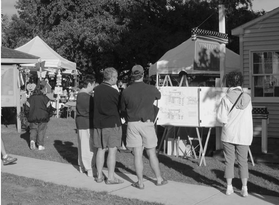
Figure 1. Participants examined and discussed refined design studies prepared by ESF students and displayed during community events at the Summer Institute of the Lake Ontario Waterfront Initiatives.

asked, “How can we accomplish this in 1,300 communities?” (DCR Division Director 2007). The Center reflected on this question several years later and realized that the commitment to answering this question drove much of the subsequent work.