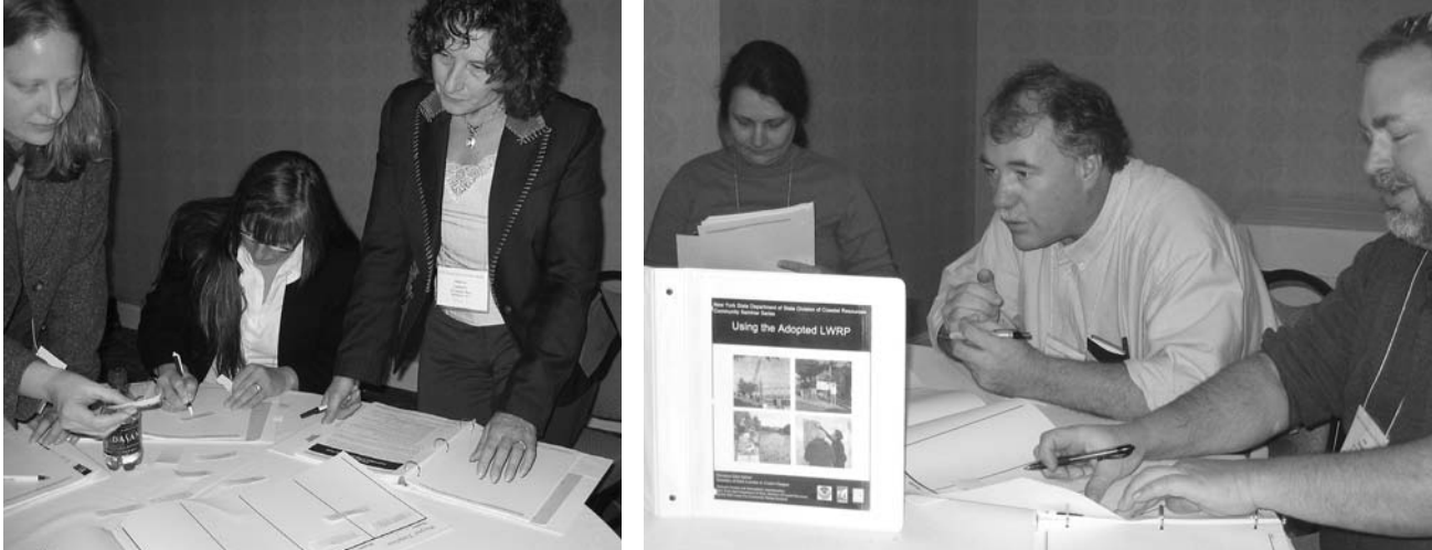
Figure 5. As part of each community education seminar, participants engaged in hands-on activities through which they applied concepts and processes introduced in the lectures.

programs as much as it involved the development of topics and content for the training modules.