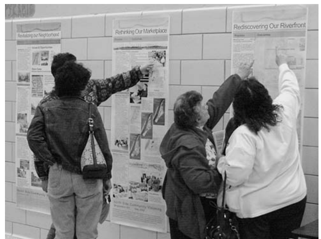
Figure 4. In working with the 12 demonstration communities, SUNY faculty members and students developed and implemented multiple strategies to promote understanding and engagement. These included (from top): matrices to strengthen community understanding of relationships; modeling to allow community members to create and visualize waterfront alternatives; photo collages to present possibilities, stimulate discussion, and develop alternatives; and documenting process and planning recommendations on banners displayed in the community.

evaluating four broad topics specific to community center revitalization: