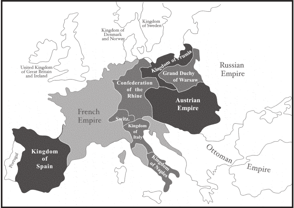
Europe in 1812.

military disasters. Napoleon's multinational Grande Armée of 1812, almost 600,000 strong with contingents from every continental European state west of the Niemen, descended upon Russia in three army groups. Napoleon himself led the main group toward Moscow. One week after the badly mauled Russian army limped away from the field of Borodino on 7 September 1812, French forces entered Moscow. Finding the Russian capital deserted, the soldiers of the Grande Armée enjoyed one night of looting before a great fire swept Moscow on the fifteenth. Unconcerned about the sea of flames that engulfed three-fourths of the city, Napoleon sought to negotiate a peace. Tsar Alexander, however, ignored all French entreaties to end the war. Alexander's intransigence added to Napoleon's concerns over the French army's tenuous lines of communication. Faced with the onset of winter, Bonaparte had two options: take up quarters in the remains of Moscow or retreat. The distance from Paris weighed heavily on the emperor, who feared, and rightfully so as the Malet Conspiracy would soon prove, that his absence