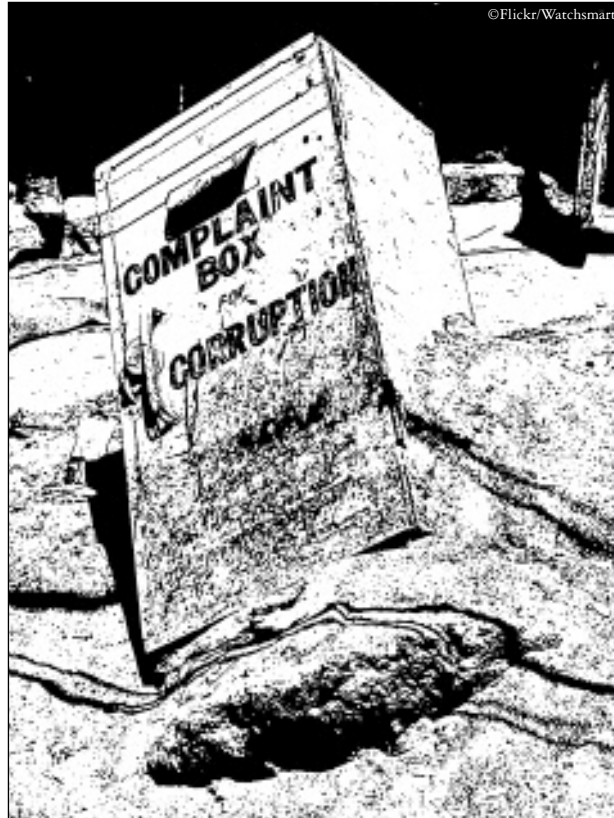
Where suggestions go in Ladakh, India.

As a fragile democracy grows in Iraq, as U.S. forces in Afghanistan try to reform governance in Kabul, and as Mexico threatens to devolve into a narco-state, we hear a strident, intensifying refrain: crime and corruption must be stamped out. But if the chorus is in harmony on the pernicious effects of these plagues—poverty, war, lack of development, poor governance—it has offered little in the way of remedy. Moreover, given how interwoven and insidious these problems often are, just which should be tackled first?