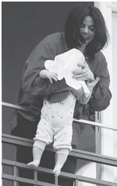
Figure 1. Michael Jackson dangles his new baby son, “Blanket,” over a hotel balcony railing (AFP, 2002).

edges the differences between the public perceptions of his own sexuality versus Jackson’s carefully cultivated reputation for being sensitive, childlike, even asexual. Furthermore, the very idea that Jackson might bring Shields back to his place for a late-night rendezvous was certainly offset by the idea that the oxygen chamber he used for a bed might make the deed slightly more difficult or that pet chimp Bubbles might burst into the room at an inopportune moment. America’s shoulder-shrugging acceptance of Jackson’s romantic escapades with Brooke Shields, Tatum O’Neal, Madonna, Debbie Rowe, and Lisa Marie Presley did not necessarily signal the arrival of a postracial America as much as the acceptance of Michael Jackson as some kind of bizarre, raceless, sexless, man-child freak. And even