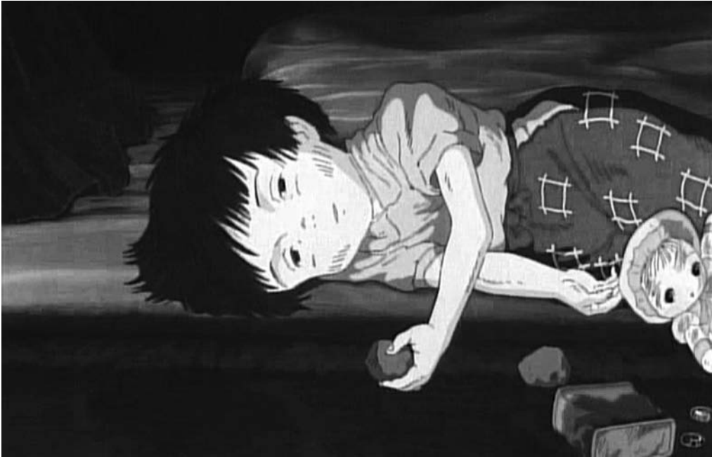
FIGURE 3. Setsuko's dying act of offering a rice ball to Seita in Grave of the Fireflies .

many tragedies. The viewer sees subtle, but horrifying, pictures of the extent of the bombings' devastation that affected other people. Early in the film, as Seita and Setsuko walk through the wreckage, trying to get back to their mother, they see other survivors walking as well. They also see many burned bodies lying in the street and hear a woman crying out for her mother. One person comments in an almost casual way: "It's not like I'm the only who lost his house. We are all in the same boat." These words reflect a level of resignation to the horrors of war.