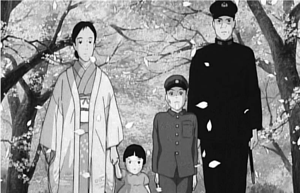
FIGURE 2. A family portrait in Grave of the Fireflies .

begins to cry loudly. The ghost Seita holds his ears, trying to keep her cries from his consciousness and the painful memories of his mother. Cherry blossoms, a common image in Japanese literature and film, representing both beauty and its transitory nature, float down.