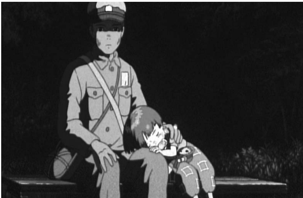
FIGURE 1. The spirits of Seita and Setsuko from Grave of the Fireflies ( Hotaru no Haka ), a film directed by Takahata Isao in 1988.

audience. The film begins and ends with Seita's death and the circularity suggests that this is a cycle that he cannot escape, even in death (Figure 1).