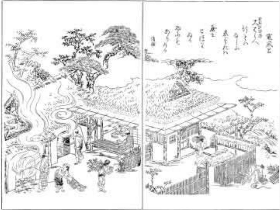
Figure 3. Yase oven bath. Miyako meisho zue 都名所図絵 (1780). 3 vols. Yoshikawa Kōbunkan, 1910–1912.

around bathing practices. Considerable work has been done on this topic; here I merely introduce the main points. Of the two terms closely associated with the bath today, furo 風呂 and yu 湯, the latter is the older of the two, having been used since ancient times to describe the hot water of natural springs. Yu was also associated with court bathing customs—the palace “bath room,” oyudono 御湯殿, being just one example. Furo is not nearly so old a term. It first appears in writing in the thirteenth century and initially referred to a steam bath. Scholars agree that the characters for furo carry no bath-related meaning; they are ateji 当て字, used as phonetic equivalents. This implies that the spoken term, furo , must have had a distinct meaning that linked it to bathing. The folklorist Yanagita Kunio 柳田国男 (1875–1962) argued that furo probably came from muro 室, cellar or cave, because some ancient steam baths were created from rock enclosures that may have resembled cellars. During the fourteenth and fifteenth centuries, the more logical characters 風炉 were used quite commonly to refer to the bath, but more generally meant a hearth or brazier, particularly of the type used for tea ( chanoyu ). 18