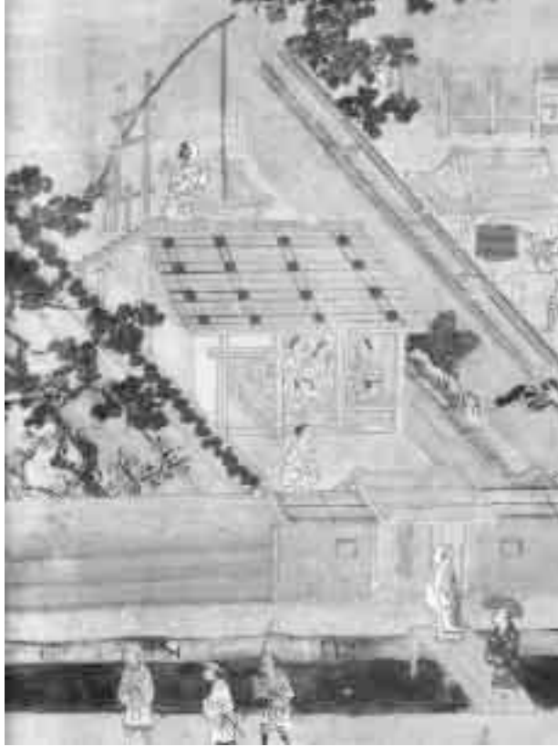
Figure 4. Detail of a bath depicted in the Machida-ke rakuchū rakugaizu byōbu (sixteenth century).

to post-illness “first baths” of other aristocrats, including Tokitsune’s wife and son, suggest that these gyōzui were hygienic baths, part of a bathing routine that was temporarily suspended because of sickness. 42 That by this time gyōzui had come to connote physical washing for purposes of cleanliness is supported by the definition in the Japanese-Portuguese dictionary of 1603, Vocabvlario da lingua de Japam : “to cleanse oneself in hot water.” 43