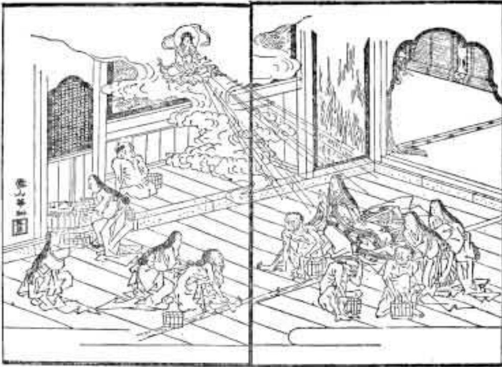
Figure 2. Tokugawa-era portrayal of Empress Kōmyō washing beggars at Hokkeji bathhouse. Sentō tebigigusa 洗湯手引草.

Religious baths of the ancient and early medieval eras were dominated by the elite. Courtiers and clerics, those who wielded power and monopolized wealth and status, set the standards for religious baths and were the primary participants in them. The occasional temple bath for commoners was in reality no more for them than were courtiers' ceremonial baths. In both instances, elite members of society were the key figures, whether as stately bathers or generous patrons. Indeed, Empress Kōmyō's name and deed remain familiar still, more than a millennium after the fact, while the unnamed thousand she bathed left the temple in obscurity, and only temporarily clean.