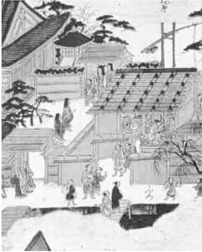
Figure 5. Detail of a bath depicted in the Uesugi-ke rakuchū rakugaizu byōbu.