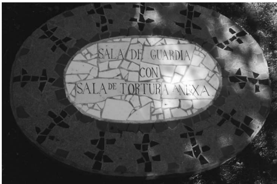
Stone markers in Villa Grimaldi that indicate “Torture Chamber.”

has reconstructed a detailed plan of the villa’s buildings and grounds when it was used as a torture center. In addition, Matta has obtained the blueprints of the villa and a map of the grounds from the time that it belonged to the Vasallo family. The room that had served as the foreman’s headquarters in the days of the villa was made into a dormitory of bunk beds, crammed tightly together with no room to sit up and barely room to walk around. This, along with the converted garage, old water tower and a few other buildings, became the detainees’ permanent homes, places from which they were taken only at mealtime at noon for lunch and at 7 P.M. for dinner, when they were brought out and seated blindfolded, eight at a time, on a small wall to eat in silence with their heads always down. Twice a day, according to Matta, they were taken to the bathroom, allowed thirty seconds in it, and then returned to their bunks to await the periodic torture sessions. Twenty percent of the detainees were women, whose treatment was the same as the men’s except that they were raped as well as tortured. The prisoners were blindfolded at all times and never allowed to talk, but they did succeed in murmuring to each other while in line for the bathroom or at some other times. Those moments of interaction Matta remembers as crucial to maintaining his sanity.