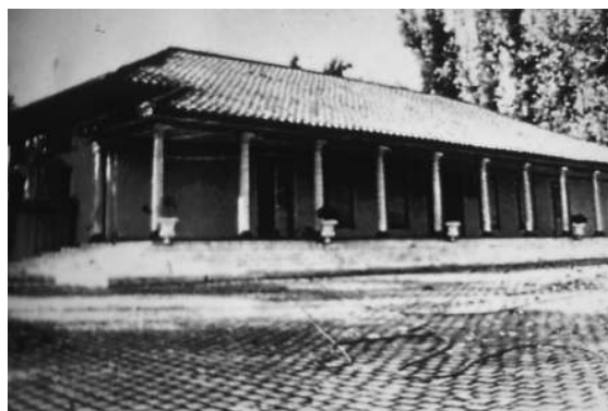
The Main House of Villa Grimaldi, Santiago. “Cuartel Terranova” was the military code name assigned to the torture center.

Foremost among the sites is Villa Grimaldi, an old villa on the edge of Chile's capital city of Santiago, which the military transformed into a major torture center from 1974–78. About 5,000 prisoners passed through Villa Grimaldi, and it is known that 240 of them were killed or disappeared. In 1995, Villa Grimaldi was commemorated as “Peace Park” and stands today as the only “memorial” of torture in Latin America. Whereas in Argentina there have been trials and convictions of members of the military who carried out the “Dirty War” that resulted in the death, disappearance, and torture of thousands from 1974–83, there is no preserved site one can