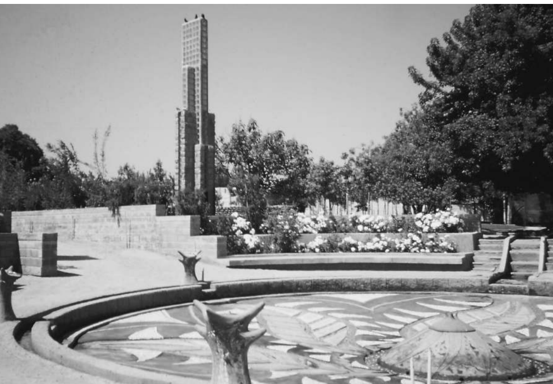
The Villa Grimaldi National Historic Site (“Peace Park”). Santiago, 1999.