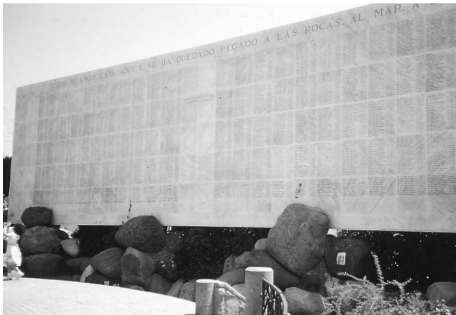
Burial vaults, many unmarked, extending along the edges of the wall of the Memorial for the Disappeared. Santiago General Cemetery, 1999.

The memory site that is probably the best known to most Chileans and international tourists is the Memorial for the Disappeared, a high, long marble wall that stands at the entrance to the Santiago General Cemetery, the city's most important graveyard. It bears the names of the more than three thousand people disappeared or murdered in Chile after the military coup. But rather than simply listing names like the Vietnam Memorial in Washington, D.C., the Memorial for the Disappeared contains crypts in the wall. When new bodies are uncovered, or identified as a part of ongoing forensic work in the unmarked graves that are constantly being uncov-