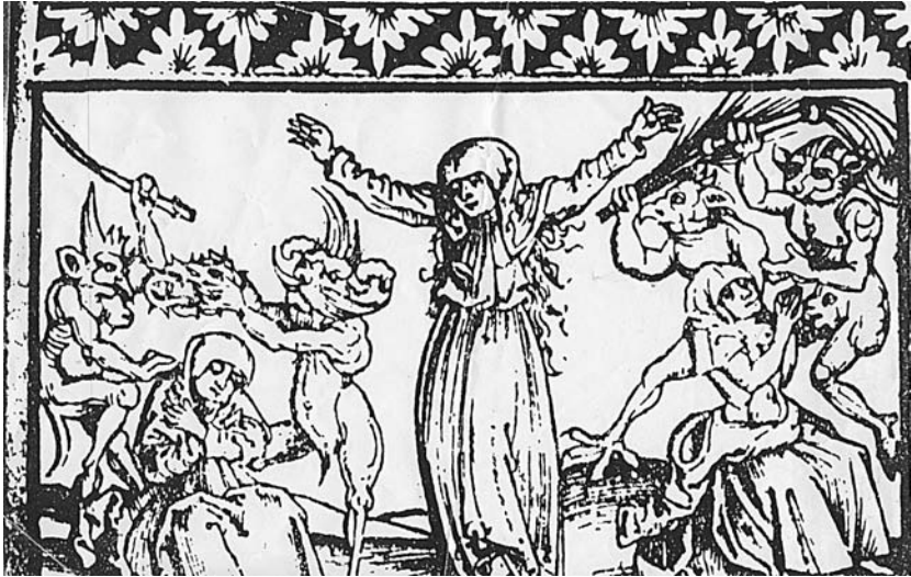
Figure 1. The woodcut on the title page of [Heinrich Kramer], Wunderbarlithe geschichten, die do geschehen synt von geystlichen wybs personen in disen Joren (Strasburg, 1502), which is attributed to Bartholomäus Kistler.

female mystics, whose names were probably never heard beyond the confines of the Italian peninsula before 1501.