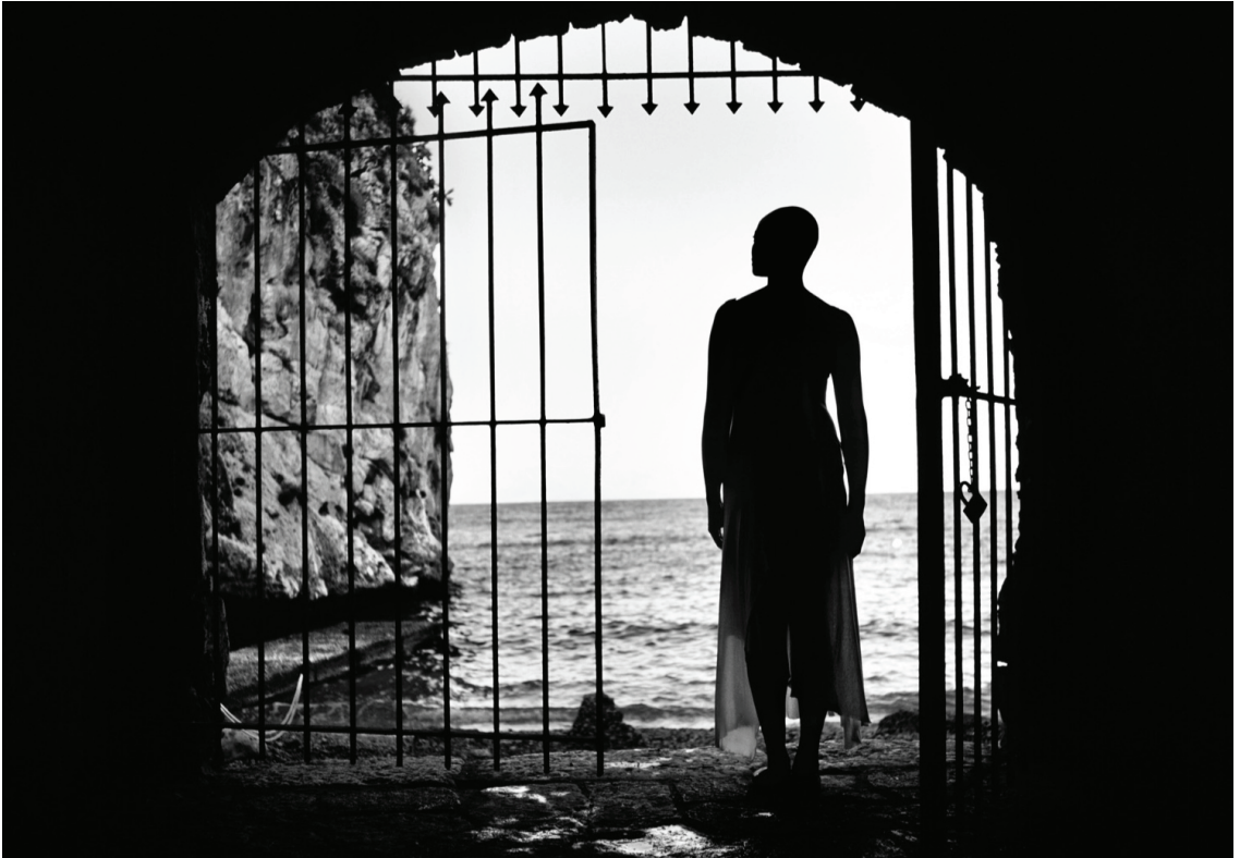
Photo: Isaac Julien, Small Boats Series , 2007. Courtesy the artist, Victoria Miro Gallery, London and Metro Pictures, New York.

PAJ is admired internationally for its independent critical thought and in-depth interviews with major international figures in the arts. PAJ charts new directions in performance, video, drama, dance, installations, media, film, and music, integrating theatre and the visual arts. Artists' writings and portfolios, critical commentary, interviews, and a special review section for performances and exhibitions are featured in the issues. Also included are new plays and performance texts from around the world.