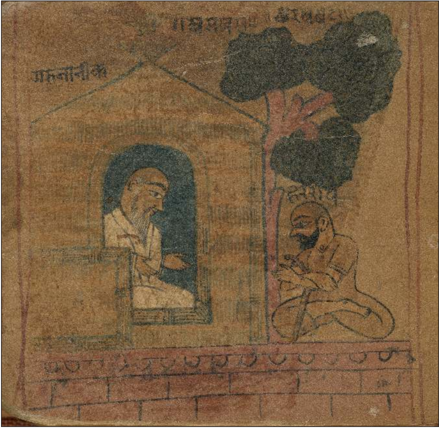
FIGURE 5. Guru Nānak and Harirāy in conversation. Wellcome Collection, MS Hindi 371, fol. 188v.