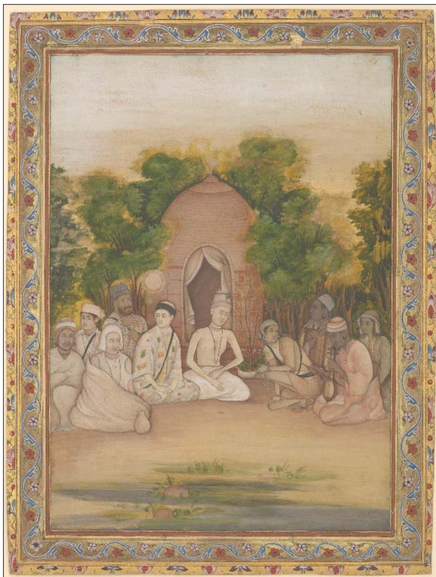
FIGURE 7. A Gathering of Holy Men of Different Faiths by Mir Kalan Khan, ca. 1770–75. Metropolitan Museum, acc. no. 2009.318.