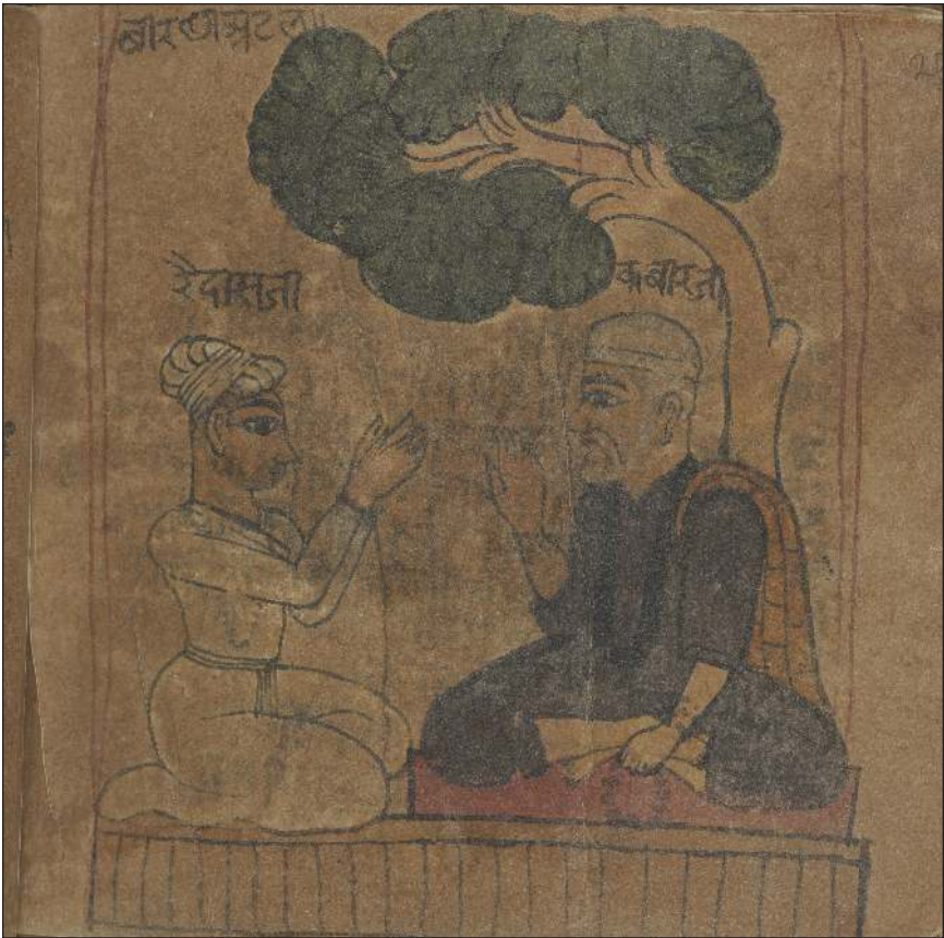
FIGURE 2. Raidās and Kabīr in conversation. Wellcome Collection, MS Hindi 371, fol. 25r.

with the depictions in the same manuscript of other gurus with their child-disciples. For instance, the image of Matsyendranāth and Gorakhnāth (fol. 136r) shows the latter clearly in a subordinate position. 17 Similarly, the image of Kabīr and Raidās shows the latter with reverently folded hands in front of Kabīr (fol. 25r). 18 By contrast, the image of Rāmānand and Kabīr itself seems to refute the hierarchical relationship between the two. Does the text do the same?