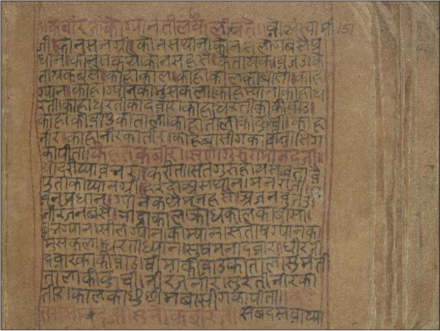
FIGURE 3. Text facing image of Rāmānand and Kabir in conversation. Wellcome Collection, MS Hindi 371, fol. 151r.

The text facing the illustration (fol. 151r; fig. 3) is fittingly that of Gyān-tilak , the conversation between Kabīr and Rāmānand. The introductory colophon, written in red ink, may be read to attribute the text to Kabīr ( Kabīraji ko gyānatilaka liṣate ), but the final colophon also includes Rāmānand ( eti kabīra jī rāmānanda jī kā gyāna tilaka saṃpūrṇa ).