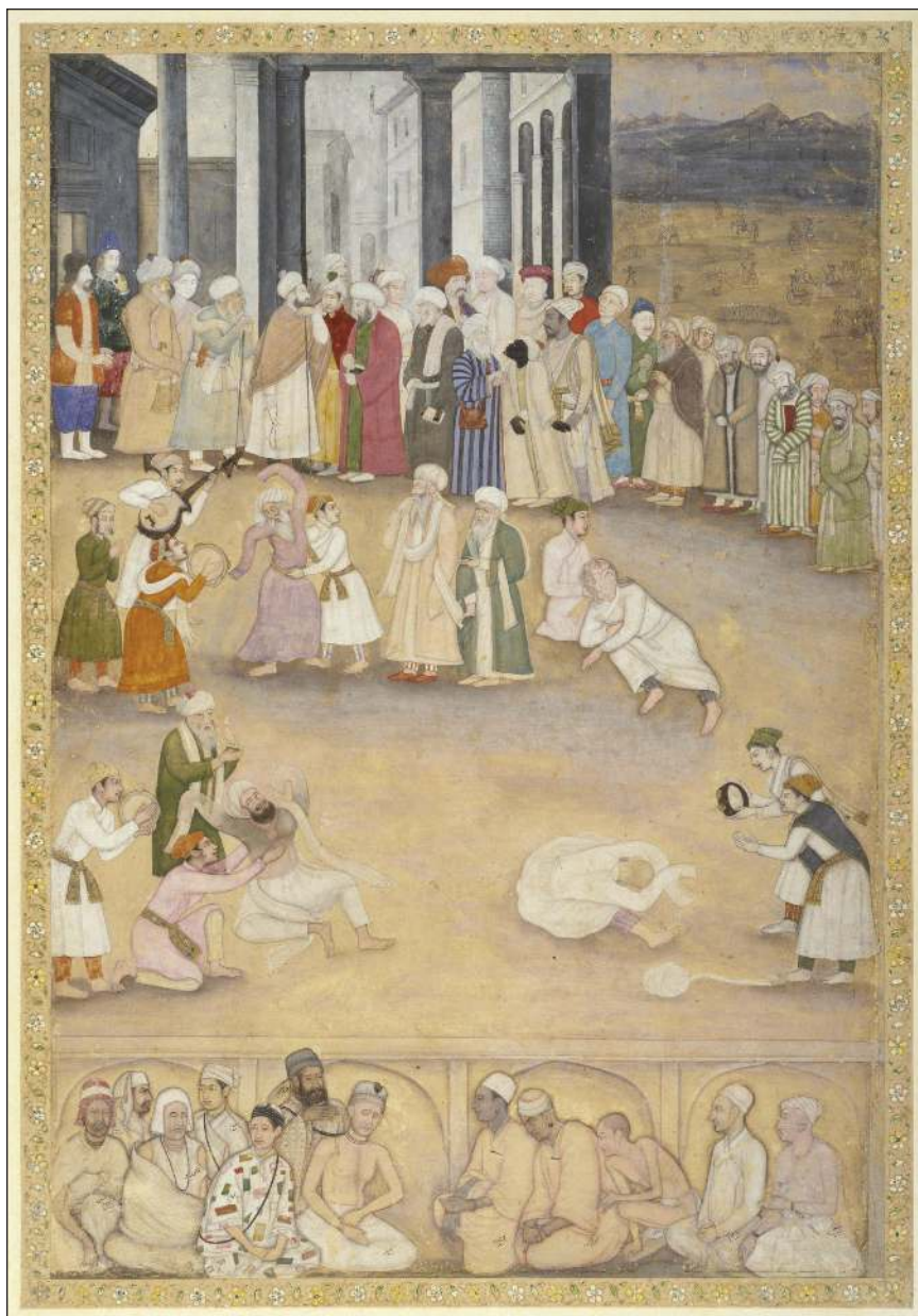
FIGURE 6. The Sants. Victoria & Albert Collection, detail of 016063 "Khwaja Sahib."