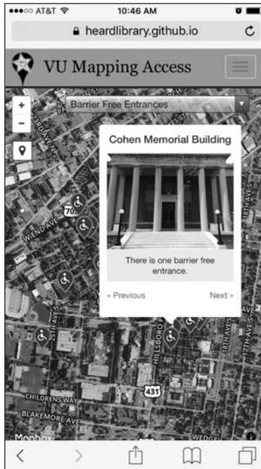
Figures 1a and b.

Experiments with critical accessibility mapping. Screenshots of two Mapping Access maps, as viewed on a web browser (a) and mobile phone (b). In both maps, the campus is viewed as a snapshot from above. Trees and buildings are visible. Both maps also include data points in bright colors with pop-ups that provide information. Image a shows information about chemical use in buildings, indicating that in one building, the soaps and chemicals are scented and that there are tiles and carpet on the floors. Image b shows information about barrier-free entrances, with an image of the front of the building.