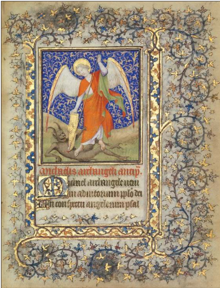
FIGURE 2. Dublin, Chester Beatty Library, formerly W MS 103 fol. 160r, leaf repurchased by the Chester Beatty Library.

his manuscripts had been made in France, suggesting a tension between his plan and his personal taste, as well as the limitations of the material available for purchase. 43