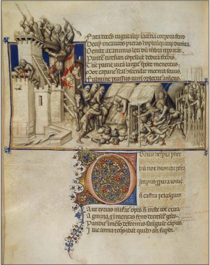
FIGURE 3. Dublin, Chester Beatty Library W 076, fol. 129v.