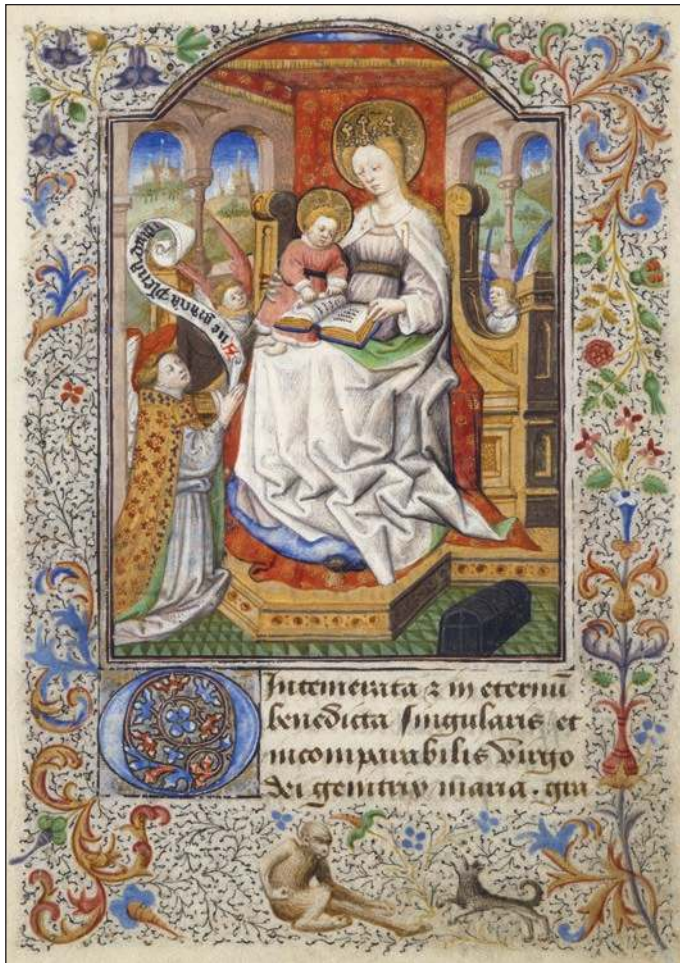
FIGURE 1. Dublin, Chester Beatty Library W 082, fol. 209r.