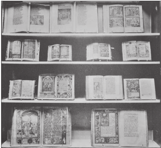
FIGURE 4. Case M at the Burlington Fine Arts Club exhibition of 1908. Beatty subsequently owned two of the manuscripts in this case (the Holford Hours is in the second row, second from the left, and Statutes of the Order of St. Michael is in the third row, far right).

The Burlington Fine Arts Club had been founded in 1856, and aimed to “bring together Amateurs, Collectors, and others interested in Art; to afford ready means for consultation between persons of special knowledge and experience in matters relating to the Fine Arts; and to provide accommodation for sharing and comparing rare works in the possession of the Members and their friends.” 87 The 1925 edition of the Club’s rules observed