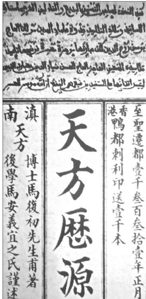
FIGURE 2. Tianfang liyuan , a bilingual (Arabic and Chinese) book on the Islamic calendar written by Ma Dexin. Published in Hong Kong in 1912, the work mainly deals with the issue of the dates set by akhunds for the time of starting and breaking the Ramadan fast.

Sidian yaohui is composed of four chapters, the last of which is titled “Zhengyi kaoshu” (正异考述, which literally means “examining and explaining orthodoxy and heresy”). 5 This chapter analyzes the origin of the “heresy” within Islam and the reason this heresy became so widespread, and highlights the grave mistakes Ma Dexin saw in Shi’ite theory. My goal here is to explicitly analyze Ma’s motivation for assaulting Shi’ism and the shaykhs of Sufi orders in China, in order to ground this theological dispute within the actual social context of Islam in Yunnan, and to explain the relationship between the broader Islamic world and Muslim communities in China.