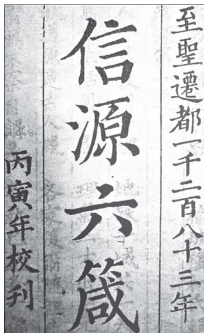
FIGURE 3. A page of Ma Dexin's Sidian yaohui (The essential understanding of the four classics) from the Chapter of the Six Tenets of the Original Faith.