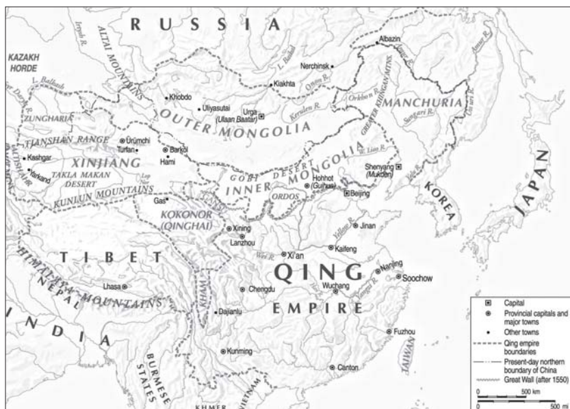
FIGURE 4. Map of Qing Empire at its maximum.

from Urumqi, he wrote a series of poems describing the exhilarating landscapes he had experienced during his exile (Ji and Li 2010). A long tradition of exile literature, extending at least as far back as the Tang dynasty, featured literati who lamented their distance from the imperial capital and described their frontier surroundings as barren wastelands. Ji Yun was different: he seems to have enjoyed the rude and energetic development of Xinjiang during this period. In one of his poems, he celebrates the new land clearance undertaken by military colonies, which brought verdant crops to the oasis of Urumqi: