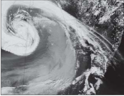
FIGURE 1. The great dust cloud of 2007.

The title “Bordering China: Modernity and Sustainability” links together three popular topics in the study of China today: (1) the frontiers and borderlands of China, past and present; (2) China’s modernization program and its connection to the imperial past; and (3) environmental history and environmental policy. How are these three themes connected?