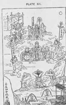
FIGURE 6. Blessing bestowed upon the generous.

There is not much good talk among our learned Confucian scholars of the special recompense of special deeds; but the principle is not to be called in question that the accumulation of good actions leads to superabundant blessing. And this year may afford fresh confirmation of its truth. He whose eyes those pictures shall affect, and whose heart they shall move to manifest his benevolence, helping his neighbours in the day of their calamity, may be sure that he is walking in the way of happiness.