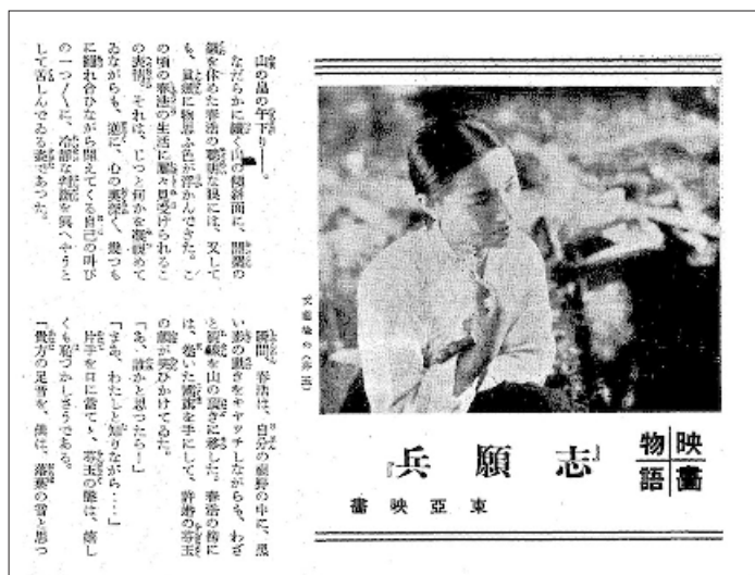
FIGURE 1 The “movie-story” version of Volunteer in Kankō Chōsen , January 1940.

protagonist, Ch’un-ho, returns to his village from a trip to the capital city of Seoul, and we can see the date marked on a placard that reads “Our Duty Behind the War,” hung out for the lecture meeting that Ch’un-ho and his friend Ch’ang-sik attend. The film does not provide a clear time marker for the ending scenes; however, the protagonist’s voyage to a training camp in the final scene suggests that the ending of the narrative may be set around June 1938, when the enrollment of the first round of volunteer recruits began. 4 The spatial backdrop of the film is harder to discern: it could be any rural village near the seaside with a train station.