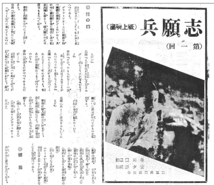
FIGURE 2 The “film-on-paper” version of Volunteer in Kokumin shinpō , June 2, 1940.

woes and even feels responsible for not being able to help him because of her low social position. However, the viewer soon finds out that the real reason for Ch'un-ho's despair is that, as a colonized Korean, he is ineligible to serve as a soldier in the Japanese army. 5 To the dismay of Pun-ok, Yŏng-ae, the landlord's younger sister and Ch'un-ho's childhood friend, visits Ch'un-ho to comfort him. Meanwhile, Ch'un-ho's friend Ch'ang-sik approaches Pun-ok in a more than friendly way, which leads Ch'un-ho to misunderstand the relationship between the two. Pun-ok's worry grows after she sees Tök-sam asking Pun-ok's father for permission to make her his daughter-in-law. On the way home from the station, where he saw Yŏng-ae off, Ch'un-ho hears the news about the volunteer recruitment system in Korea from the village chief and imagines himself undergoing training to become a volunteer. Pun-ok meets Ch'un-ho and relays the apology from Ch'ang-sik, which he made before leaving for Seoul. However, Ch'un-ho says that there are more important matters and reveals his determination to become an imperial soldier. Upon reading the news of Ch'un-ho's acceptance into the imperial army in