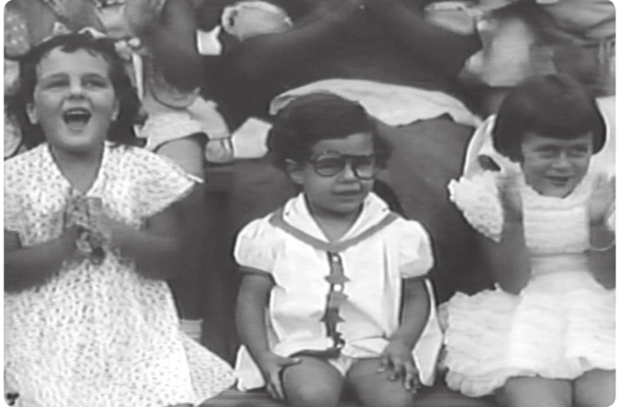
Frame from The Kidnapper's Foil , San Marcos, Texas (circa 1930s). Texas Archive of the Moving Image.

via the TAMI video library, wrote a small piece for the paper about the number of emotional reactions to seeing the 1949 Graham film. The article, quoting one of the members of the San Marcos Heritage Association, articulates the value of itinerant film productions to contemporary audiences, stating that whereas “photographs [were] one thing . . . seeing live videos of . . . meetings and . . . buildings, it’s simply amazing. . . . It increases your sense of community.” 50 By the end of the weekend following the article’s publication, the film had been viewed over six thousand times and continues to climb toward being one of the most watched films in the TAMI collection. As of summer 2010, the film had been viewed nearly twelve thousand times.