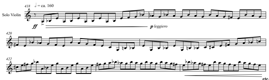
Fig. 14b. 1959 version, Part II, mm. 418–24 (solo violin only)