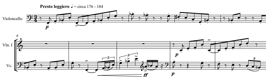
Fig. 2. 1950 version, Part III, mm. 1–10

ment on the first page, “1st revisions for 2nd performance,” and on the last page, “Work completed July 13, 1947—Revised last movement in 1954. Completed June 22. W.S.” 25 In this revision the composer makes wholesale changes to what were Parts II and III of the work.