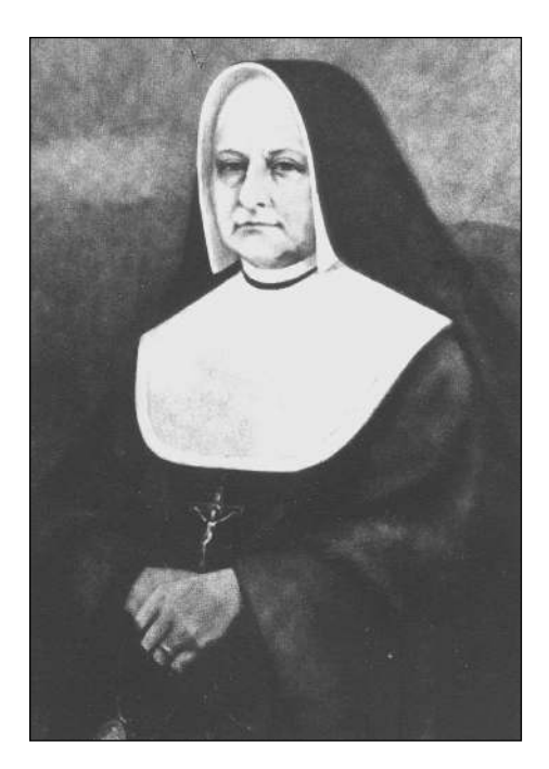
Figure 1. Mother M. Theresa Maxis, First Superior of IHM Congregation.

Settling her estate delayed her entrance, and her dowry was the first major gift mentioned in the early records.<sup>6</sup>