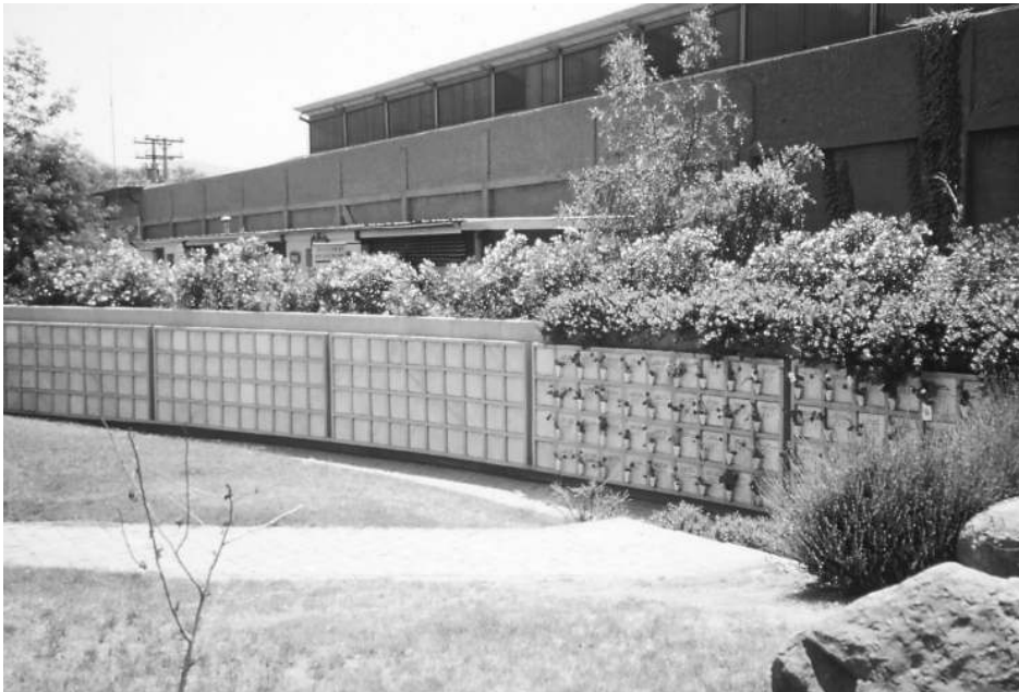
“Patio 29” containing the unmarked graves (“NN” for no nombre ). Santiago General Cemetery, 1999.

In another section of the cemetery is “Patio 29,” the municipal potter’s field where the mutilated, tortured, and executed bodies were dumped by the military government, buried in graves marked “NN” ( no nombre , no name). As opposed to the Memorial for the Disappeared, there is no way a tourist or visitor to the cemetery would know of this plot. It has no marker or commemorative explanation. After the September 1973 coup, the plot was used to bury many bodies found on the streets of Santiago, including those who were killed by multiple gunshots and snipers, those who were executed by machine-gun fire, and those who died while in police confinement. The police and military made no effort to identify those bodies, simply dumping them in graves marked with crude metal crosses with “NN” painted on them. Hundreds of victims, many of whom are still listed as disappeared, were