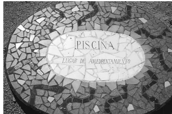
The marker identifying the swimming pool literally states: “Swimming Pool: A Frightening Place.” This refers to the way the DINA used the pool as a tool for rewarding collaborators and threatening others. In the winter of 1975, a male prisoner was tortured in the pool and recorded as dying of hypothermia.