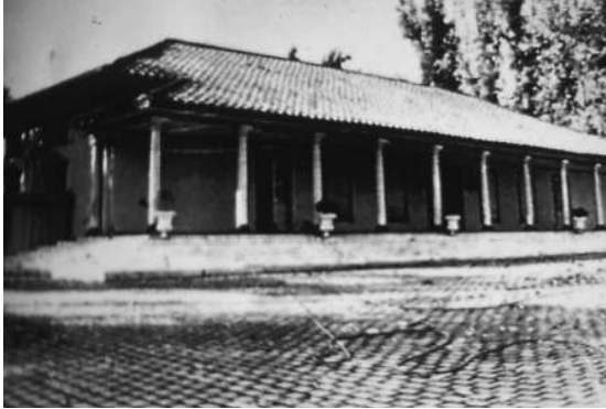
The Main House of Villa Grimaldi, Santiago. “Cuartel Terranova” was the military code name assigned to the torture center.

Foremost among the sites is Villa Grimaldi, an old villa on the edge of Chile's capital city of Santiago, which the military transformed into a major torture center from 1974–78. About 5,000 prisoners passed through Villa Grimaldi, and it is known that 240 of them were killed or disappeared. In 1995, Villa Grimaldi was commemorated as “Peace Park” and stands today as the only “memorial” of torture in Latin America. Whereas in Argentina there have been trials and convictions of members of the military who carried out the “Dirty War” that resulted in the death, disappearance, and torture of thousands from 1974–83, there is no preserved site one can