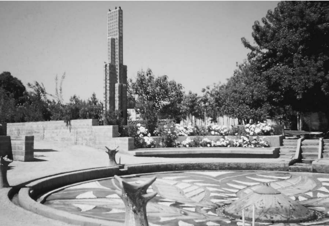
The Villa Grimaldi National Historic Site ("Peace Park"). Santiago, 1999.