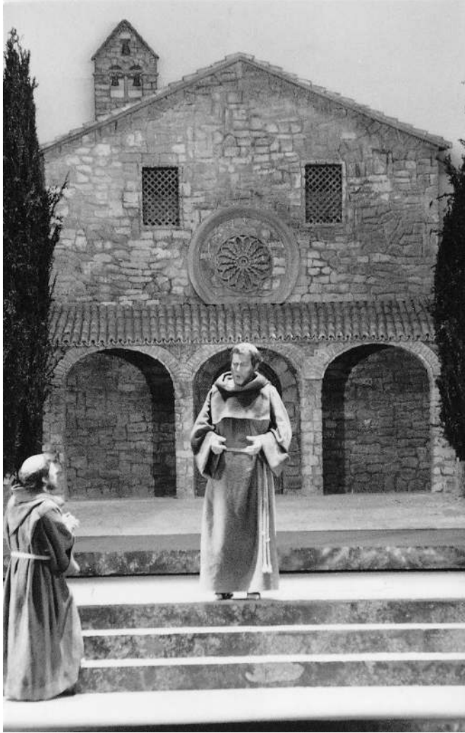
José van Dam in the title role of Messiaen's Saint François d'Assise, Paris Opéra 1983.

Such important documents as Aristotle's Nicomachean Ethics and, more recently, the American Declaration of Independence are attempts to respond to this human need. Aristotle denies the possibility of happiness to anyone, for disaster could befall an individual at any time. The authors of the Declaration of Independence wisely express this desire for happiness in terms of a pursuit and not necessarily an attainment. As St. Francis comes to a greater understanding of the answer, one is made to realize that suffering is not independent from hap-