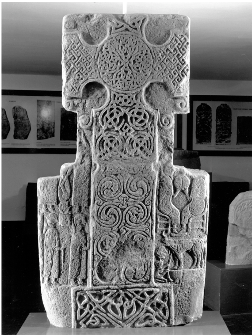
Fig. 1 St Vigean's, Angus, no. 7.