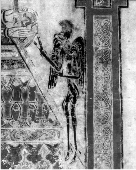
Fig. 3: The devil from the Book of Kells, folio 202v.; detail.

Vigean's man is Longinus in antithesis, and his knife equates with the spear which Longinus invariably holds. Unlike Longinus, who by tradition was cured of blindness by contact with Christ's blood, the St Vigean's man seems to seek not a curative draught but gratification; that he faces away from the cross connotes blindness of a spiritual kind.