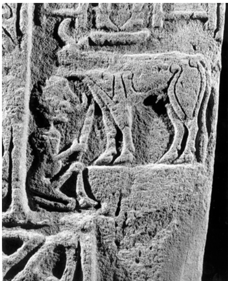
Fig. 2 St Vigean's, Angus, no. 7; detail.

characterised the diabolical in common terms. 4 Moreover, that the cross-shaft on the St Vigean's slab bears spirals ending in the heads of animals, birds and men has caused Isabel Henderson to observe that 'The use of human heads as spiral terminals is precisely what one would expect to find in the Book of Kells'. 5 Unable to find an example, she concludes that St Vigean's no. 7 discloses a Pictish sculptor behaving like a Book of Kells artist although not executing a design used in that manuscript. 6