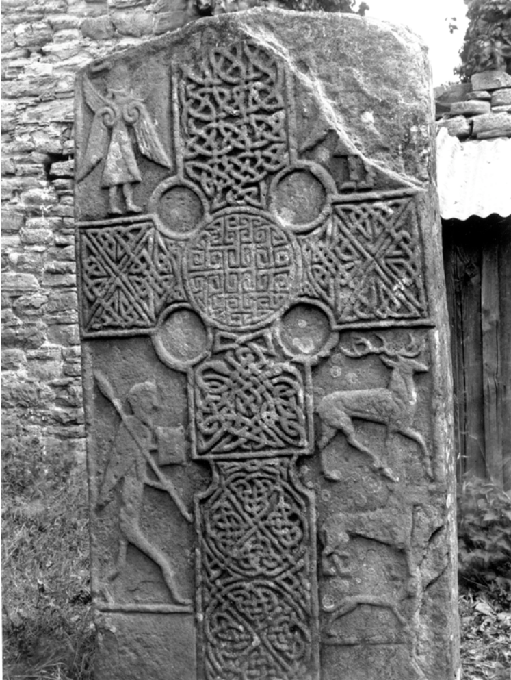
Fig. 5 Eassie, Angus.

CORMAC BOURKE IS CURATOR OF MEDIEVAL ANTIQUITIES AT THE ULSTER MUSEUM, BELFAST